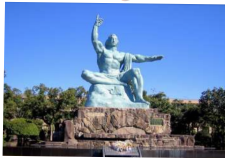
长崎和平公园 / Nagasaki Peace Park