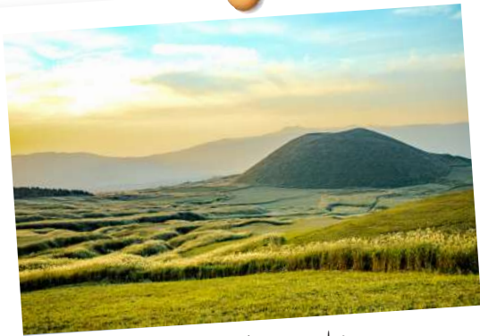
米土家 / Komezuka

Also known as "Ginkgo Castle", it is considered one of Japan's three famous cities due to its long history and is also a national special historical site.