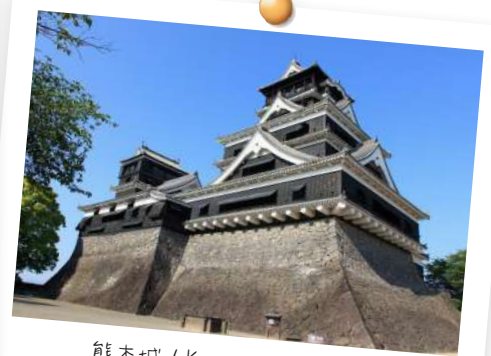
熊本城 / Kumamoto Castle