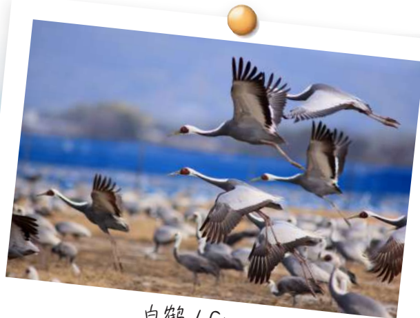
白鹤 / Crane