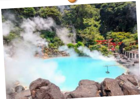
地獄谷 / Umi Jigoku